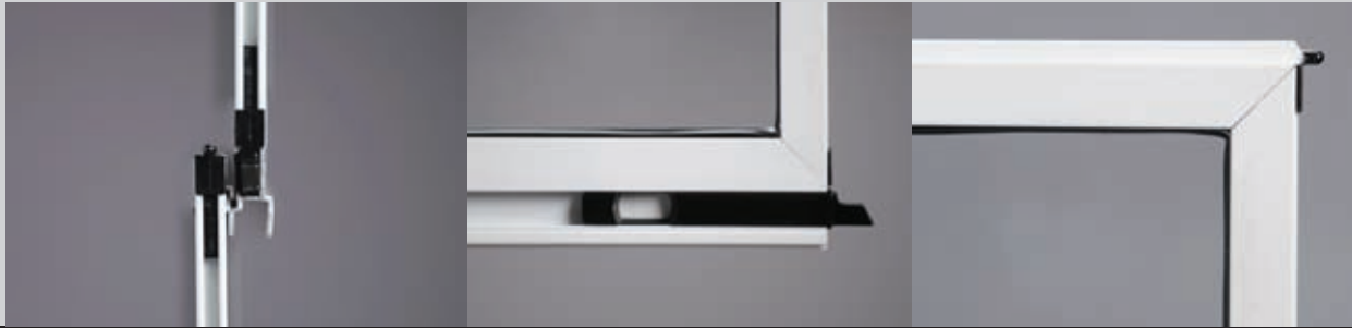
MECHANICAL INTERLOCKING MEETING RAIL