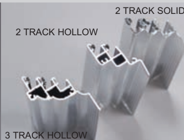
MAIN FRAME SECTIONS