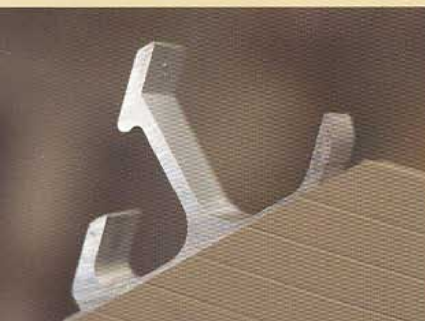
EXTRA HEAVY CORNER GUSSETS