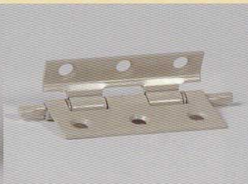
HEAVY DUTY HINGES