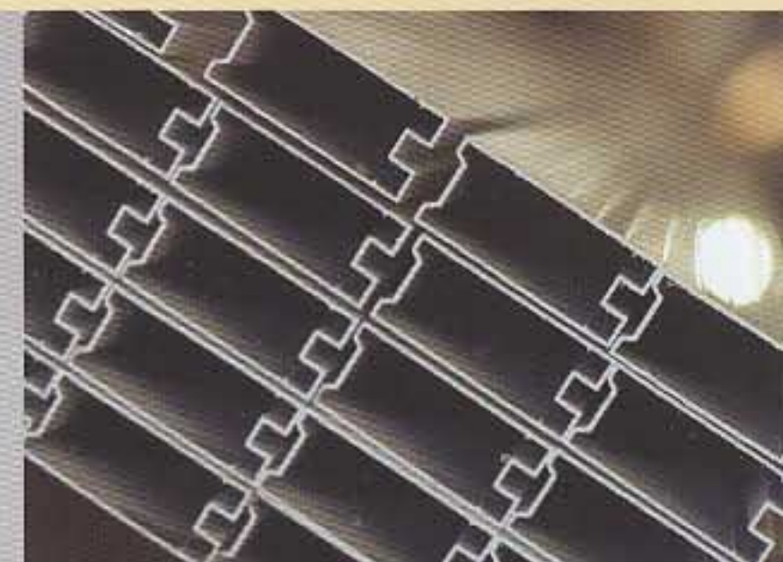
EXTRUDED TUBULAR MAIN FRAMES